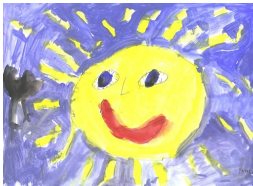
Art by Yamuna Gerritsma.

Genetically engineered foods containing genes derived from bacteria and viruses are now starting to appear in the shops, and foods with insect, fish, and animal genes will soon follow. These genetic changes are radically different from those resulting from traditional methods of breeding. Yet, the sale of these foods is being permitted without proper assessment of the risks and without adequately informing the public, even though many scientists say that genetically modified foods could cause serious damage to health and the environment.