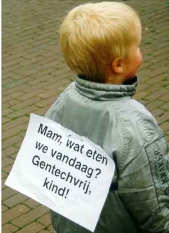
A photo of Sjen was published in a newspaper. The message on his back says; "Mum, what are we eating today? GMO-free, child!"