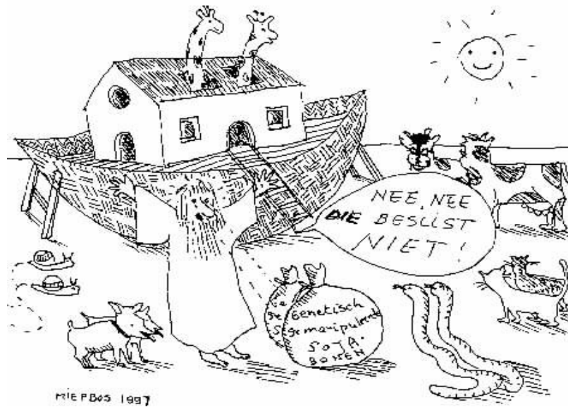
Noah; "No, no not you!"