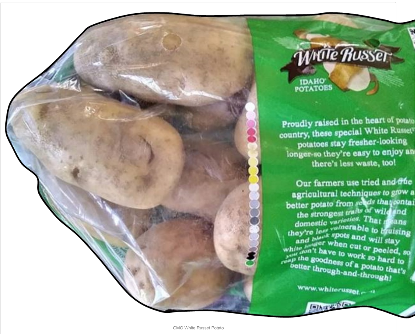
GMO White Russet Potato

I should not have accepted the invitation. I knew, even then, that pathogens cannot be controlled by single genes. They evolve too quickly around any barrier to infection. It takes about two to three decades for insects and plants to overcome a resistance gene, but it takes only a few years, at most, for pathogens to do the same.